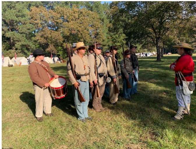
The 3 rd Miss Inf. fell in with the 31 st LA Inf at Pleasant Hill, LA. Nov. 7, 2020.