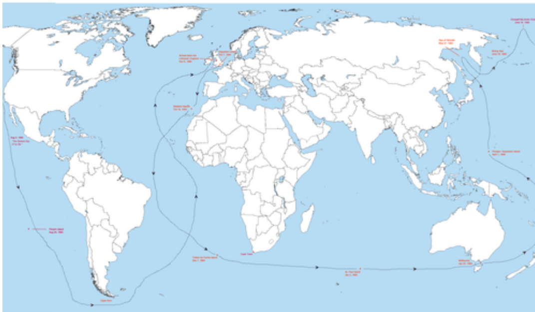
Map of the Route of the CSS Shenandoah