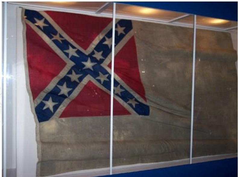
Naval Ensign Flag from the Shenandoah